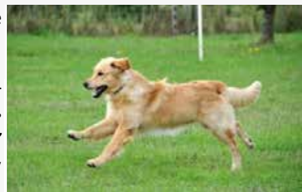
Trigger in full flight

'Boycie arranged for Trigger before he left you' I think they may be right!